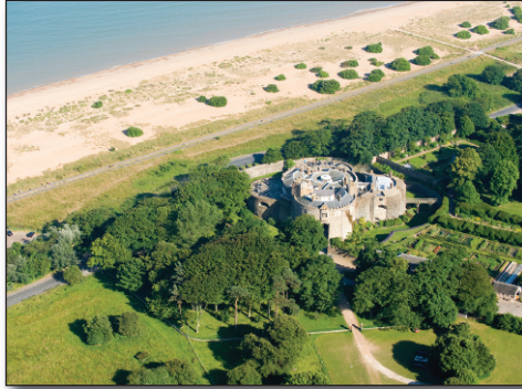
Walmer Castle became the official residence of the Lord Warden of the Cinque Ports in 1708.