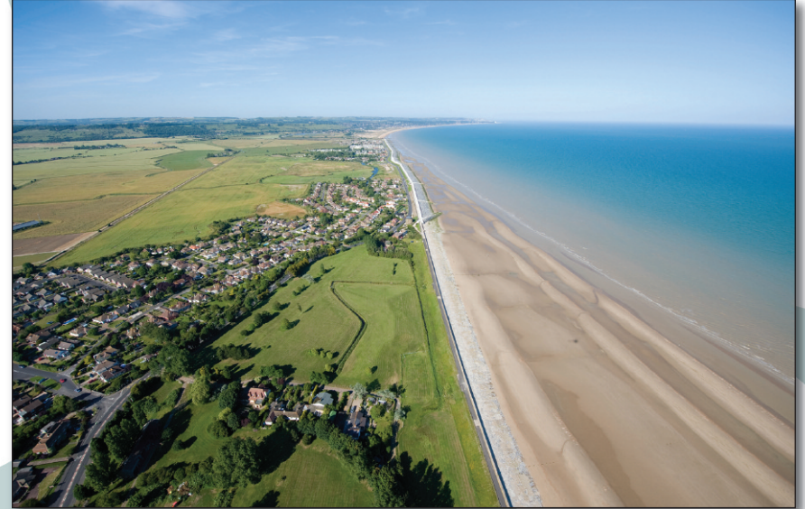
A superb view up the coast from Dymchurch looking towards Hythe, Sandgate and Folkestone.