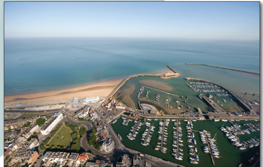
Looking out to sea over the marina and beaches at Ramsgate.