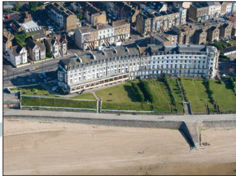
Royal Terrace, Margate.