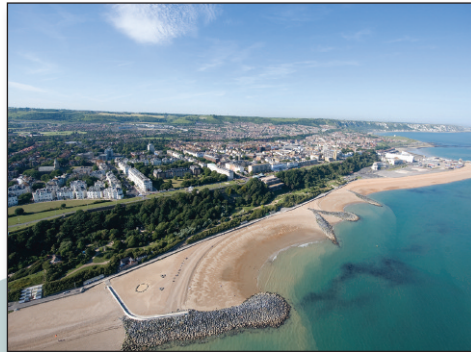
Looking east over Folkestone, Dover far distant.