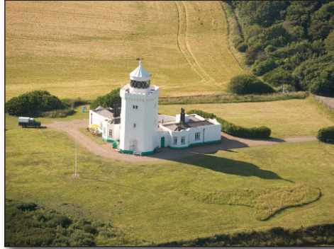
South Foreland lighthouse, today a visitor attraction.